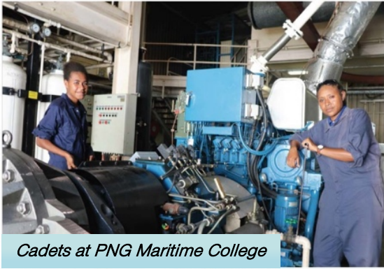
Cadets at PNG Maritime College