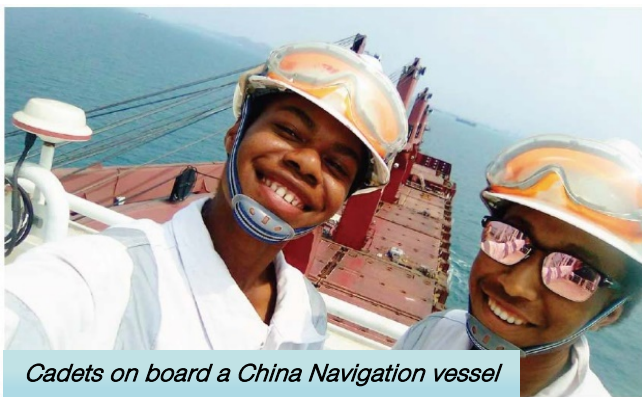
Cadets on board a China Navigation vessel