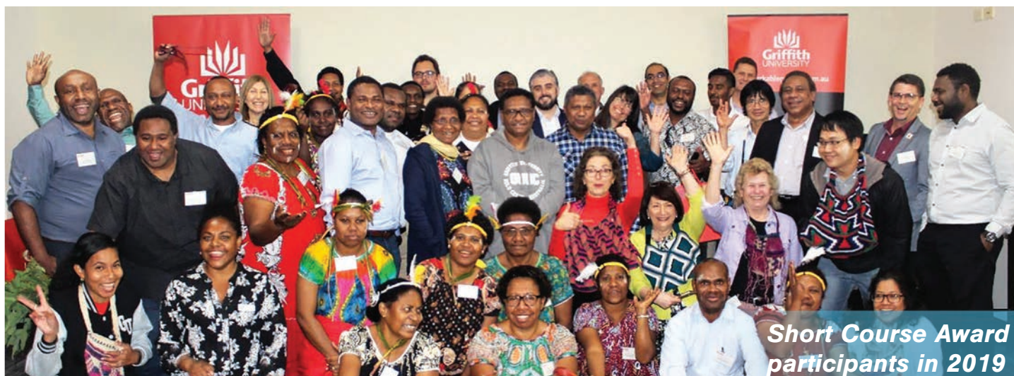
Short Course Award participants in 2019

In 2019, 23 participants completed the Australia Awards Short Course in Health Economics, delivered by Griffith University in Australia.