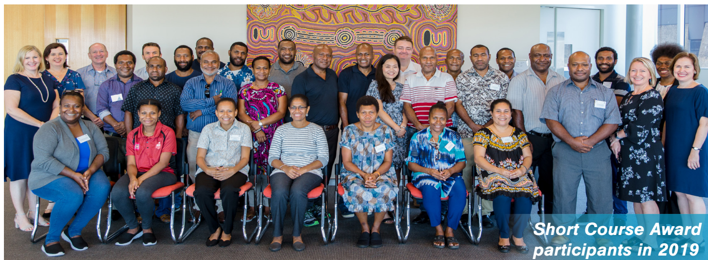
Short Course Award participants in 2019

In 2019, a total of 26 PNG professionals completed the Australia Awards Graduate Certificate in Environmental Management (Climate Change Policy), delivered by the University of Queensland.