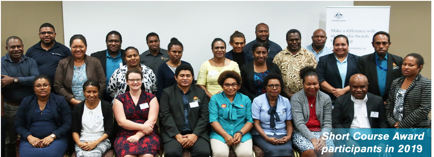
Short Course Award participants in 2019

Since 2017, a total of 51 PNG professionals have graduated with an Australia Awards Graduate Certificate in Human Resource Management