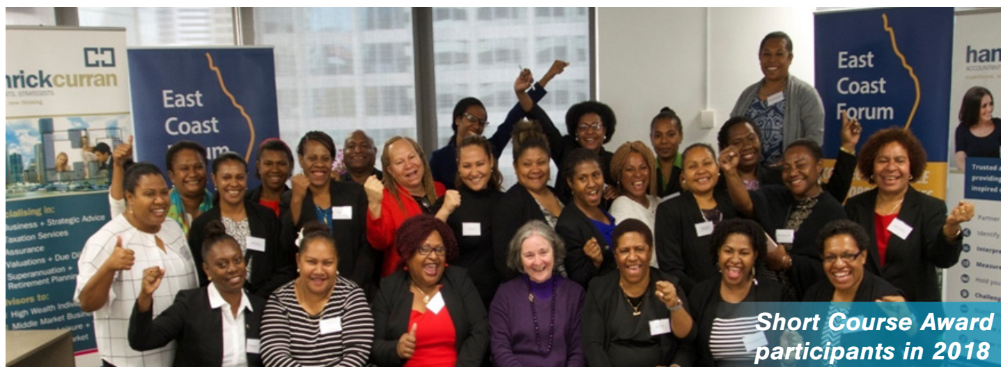
Short Course Award participants in 2018

Since 2017, there have been 51 graduates of an Australia Awards Certificate IV in Entrepreneurship and New Venture Creation