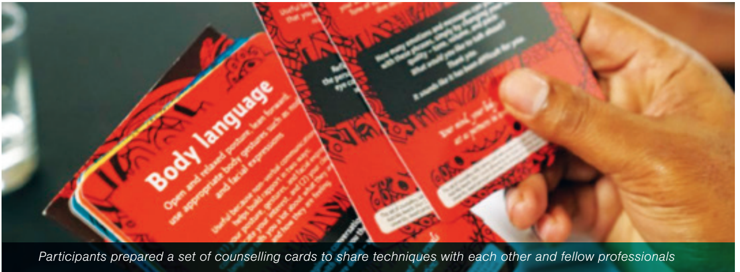
Participants prepared a set of counselling cards to share techniques with each other and fellow professionals

25 participants completed the inaugural Australia Awards Graduate Certificate in Counselling in 2019 and concurrently studied a Certificate IV in Training and Assessment.